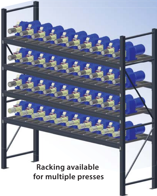
Racking available for multiple presses

High protien, High nutrition livestock feed